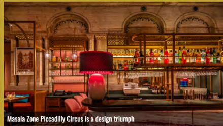
Masala Zone Piccadilly Circus is a design triumph

WELCOME POST-COVID REBOUND FOR UK HOTELS