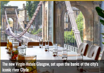
The new Virgin Hotels Glasgow, set upon the banks of the city's iconic river Clyde

WELCOME POST-COVID REBOUND FOR UK HOTELS