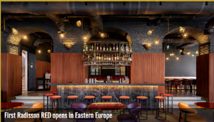
First Radisson RED opens in Eastern Europe