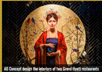
AB Concept design the interiors of two Grand Hyatt restaurants

CONTRACT FURNITURE FOR RESTAURANTS & BARS